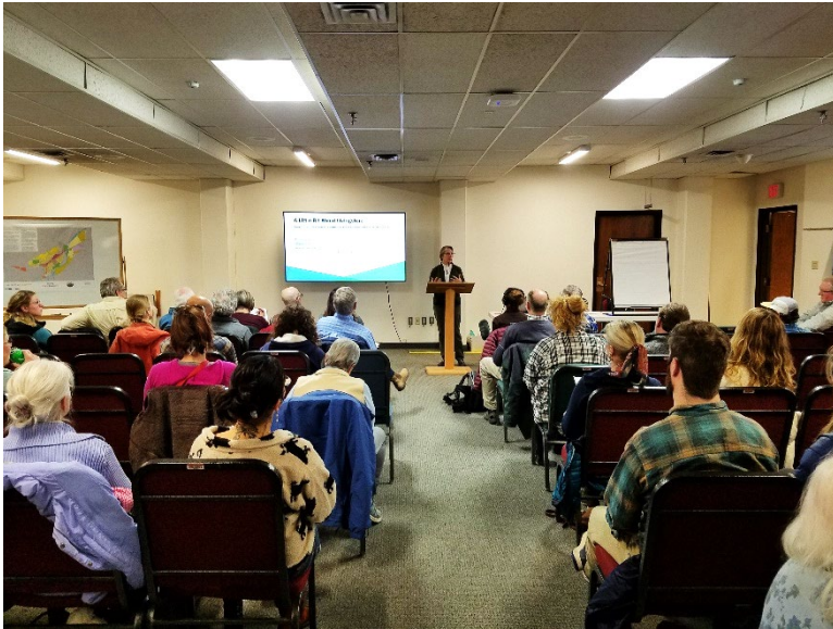
Image 1. Over 60 people attended the 1/28/20 Community Meeting.