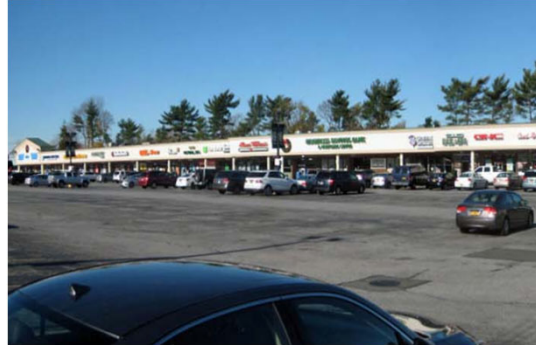
These concrete landscapes demoralize people