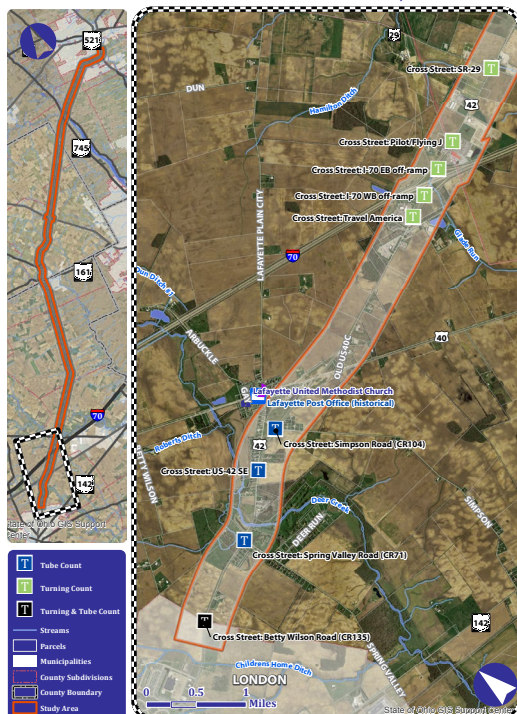
Traffic Count Locations 1/7