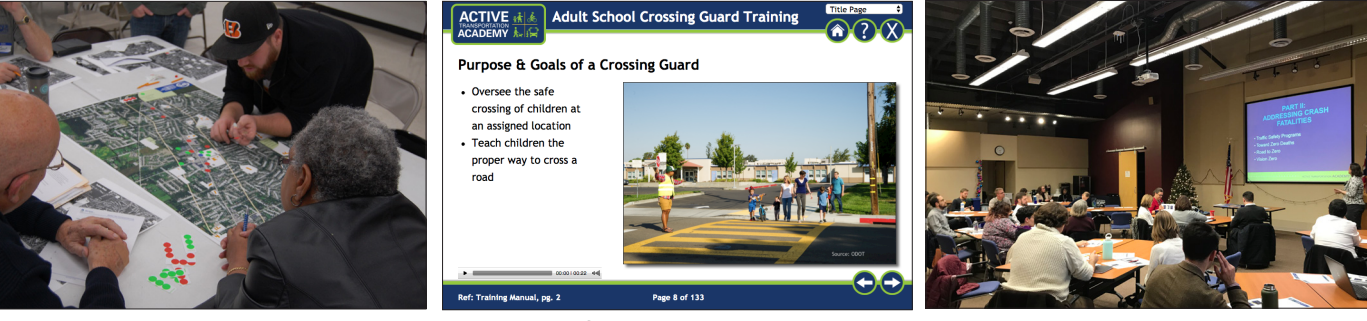
Public Engagement Activities