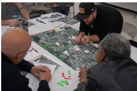
Public Engagement Activities