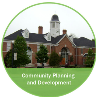
Community Planning and Development

The firm's multi-disciplinary staff include certified planners, licensed engineers, LEED accredited professionals, and a sUAS Remote Pilot, along with environmental specialists, educators, and instructional designers. The staff have comprehensive skillsets in community planning and development, multi-modal transportation planning, environmental and resiliency planning, and education and public engagement.