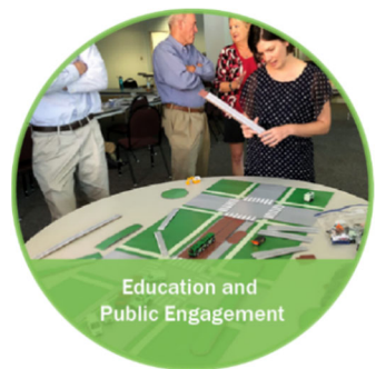
Education and Public Engagement