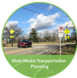
Multi-Modal Transportation Planning