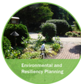
Environmental and Resiliency Planning