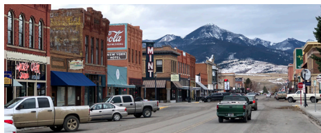
Livingston Growth Policy Update City of Livingston, Montana