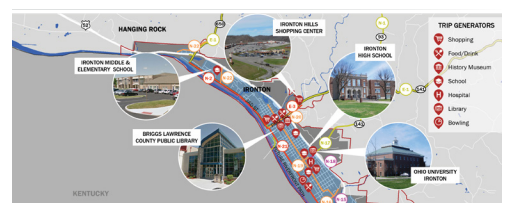
Lawrence County Non-Motorized Study KYOVA Metropolitan Planning Organization