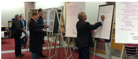
Dayton Sustainability Plan City of Dayton, Ohio